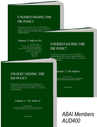
ABAI Members AUD400

A Comprehensive Guide on the cover afforded by the Industrial Special Risks Policy for Insurance Brokers and Advisers, Underwriters and Claims Officers, Loss Adjusters, and Risk Managers: Volumes 1, 2 & 3